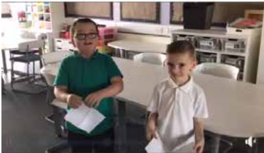
25 14 comments 2 shares