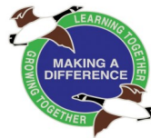
Dormanstown Primary Academy